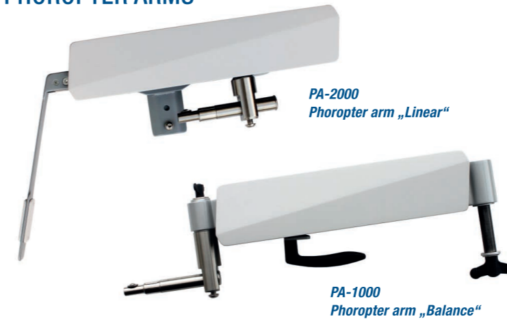
PA-2000 Phoropter arm „Linear“