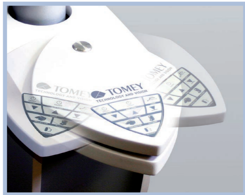
The rotatable control panel allows the user comfortable operation of the whole unit and the additional devices.

TRU-1000 comes with the reclinable chair ER-3000. This chair has a fresh and modern design, which fits perfectly to the compact TRU-1000. Choose your preferred phoropter arm to complete the smart setup.