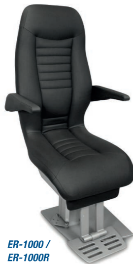
ER-1000 / ER-1000R

ER-1000 / ER-3000 Electrical reclinable chair with arm and foot rest (weight: ER-1000 = 45 kg / ER-3000 = 55 kg)