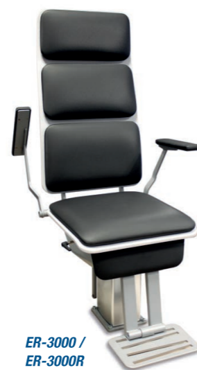
ER-3000 / ER-3000R

ER-1000R / ER-3000R Electrical reclinable and rotatable chair with arm and foot rest (weight ER-1000R = 47 kg / ER-3000R = 57kg)