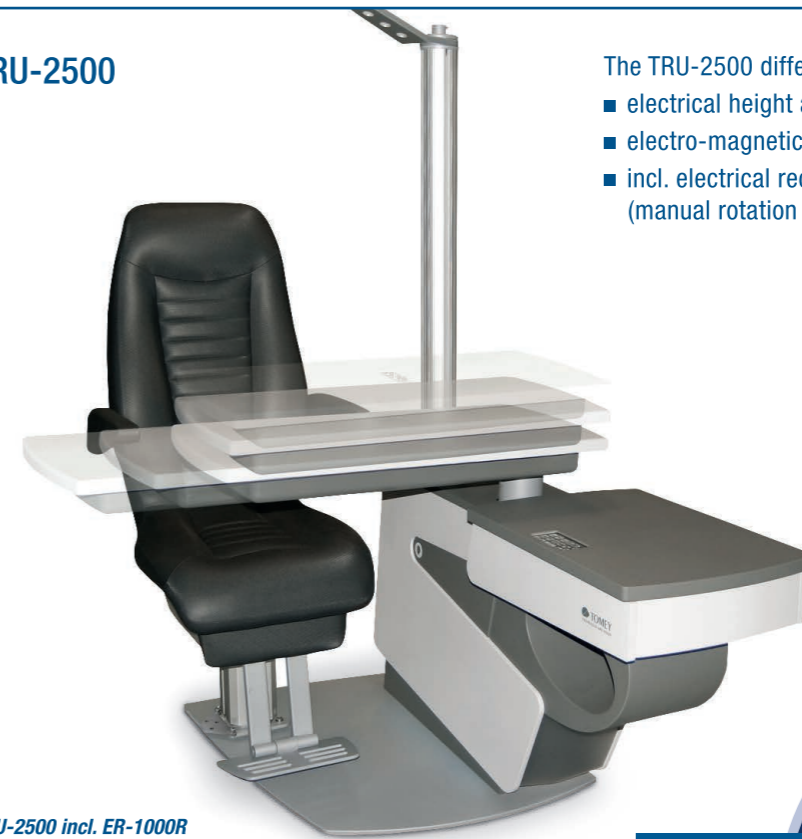
TRU-2500 incl. ER-1000R