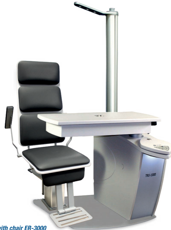
TRU-1000 with chair ER-3000